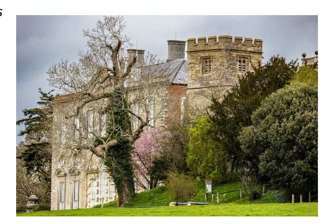
The team are busy behind closed doors preparing to re-open Claydon House in May.

Fridays and Saturdays between 11am and 3pm until October (pre-booking recommended). Discover sumptuous interiors or explore the grounds, taking your visit at your own pace.