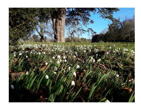
A glimpse of our 'Stowedrops' walk

Where did the New Year go? It felt like spring had sprung very quickly, only for us all to be reminded of the weather's mighty force over the past few weeks. Well, it's certainly keeping our gardeners on their toes and flowers all confused! Fortunately, the adverse weather has not deterred the hardy snowdrops, cyclamens and aconites, and we've had a lovely display in the gardens. Our gardeners are now busy with tidying up the gardens after a week of storms, and ensuring the gardens return to their true glory.