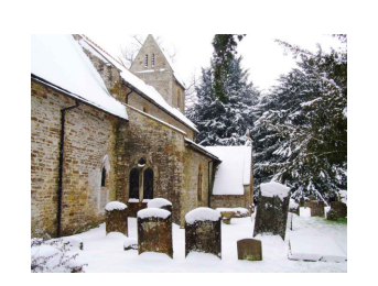
April 3rd St Augustine, Westbury