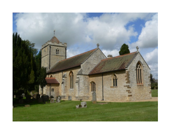
March 20th Assumption of the BVM Leckhampstead